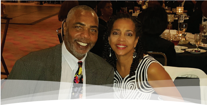
Reds great Dave Parker was the grand marshal at the Cintas Sunflower Rev It Up for Parkinson's.

Former Major League Baseball star Dave Parker, shown with his wife, served as Grand Marshal for the Cintas Sunflower Rev It Up for Parkinson's event on Sunday, Sept. 11, at Sawyer Point Park in downtown Cincinnati. The event benefited the James J. and Joan A. Gardner Family Center for Parkinson's Disease and Movement Disorders.