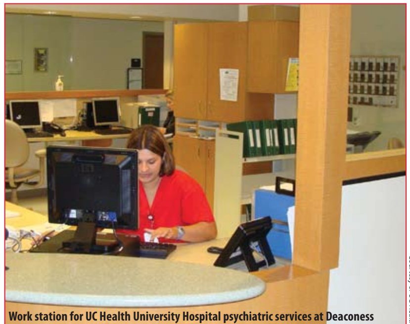
Work station for UC Health University Hospital psychiatric services at Deaconess