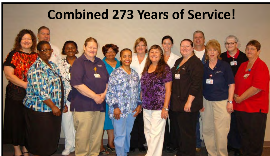
Combined 273 Years of Service!