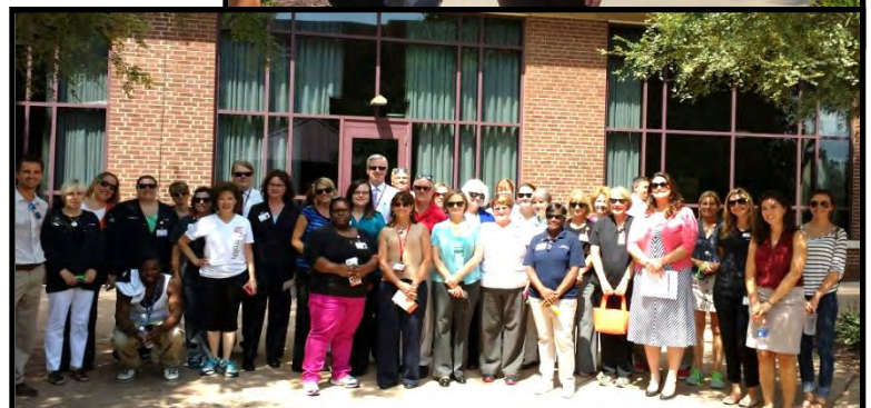
Associates and representatives from sponsors American Heart Association and Medpace took part in the one-mile walk.